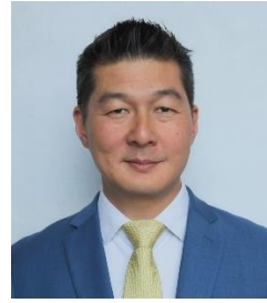
Vice President of Technology for Industrial & Energy Technology, Baker Hughes

After holding various engineering leadership roles in the Company, since 2020 he has served as Director of the Product and Technology Unit in Switzerland and Italy, currently reporting to CEO. His current scope oversees gas turbine, steam turbine and generator development and R&D budget management across Ansaldo Energia portfolio.