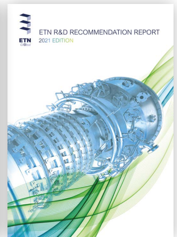
ETN Global 2021 R&D Recommendation Report